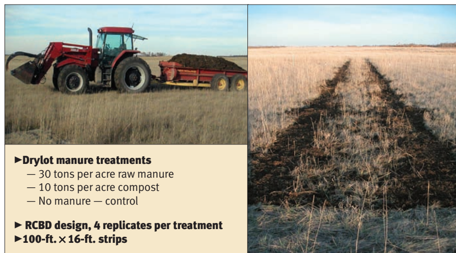
Fig. 2: Application of manure and compost from drylot feeding